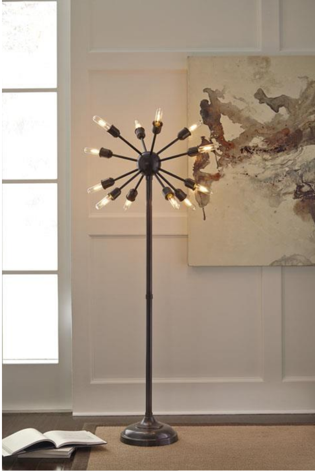
Recalled Amnon floor lamp